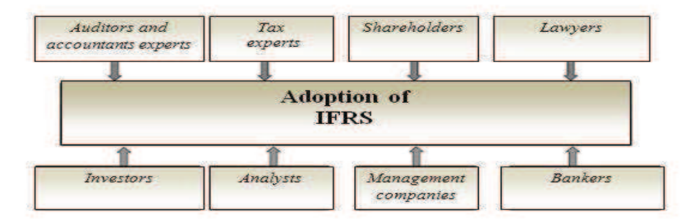
Fig. no. 3 Ranges of members for IFRS's adoption Source: [14]

The expansion of IFRS adoption in Romania was due to the conditions imposed to the Romanian authorities by the international creditors – The International Monetary Fund, as an instrument of development (the improvement of financial stability and of the investors' trust in the Romanian economic area). For that, in 2010, the Romanian National Bank and the Ministry of Public Finance reconfirmed their commitment of adoption of the necessary legal framework for the comprehensive application of IFRS at the beginning of 2012 (Section 25 of the letter of intent signed by the Romanian authorities in Bucharest, in 2010, 16<sup>th</sup> of June, Act 257/2010). [5]