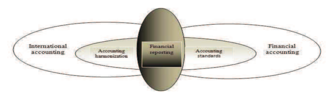
Fig. no. 1 Accounting area of research Source: [9]

In order to emphasize the importance of this research, I turned to adapting the initial form of the graphic representation of Istrate, C. (2012) from a study published in 2012: