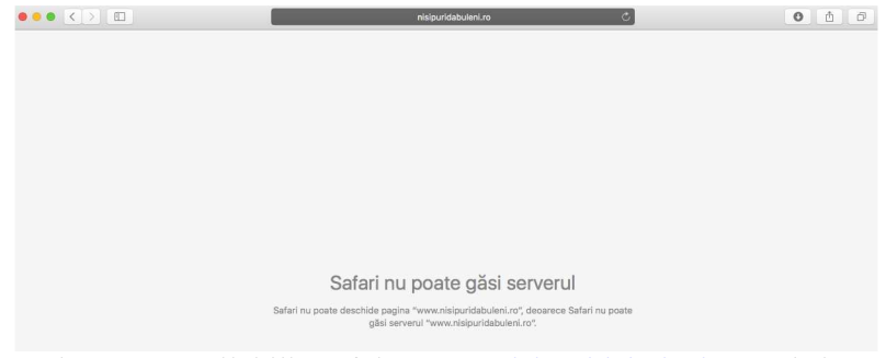
Fig. 2. Unavailability of the www.nisipuridabuleni.ro website

As for the promotion of existing tourism sources as well as the conservation activities, the Management Plan mentions the site <a href="http://www.nisipuridabuleni.ro">http://www.nisipuridabuleni.ro</a>, which has been set up as part of the SMIS CSNR: 43265 "Elaborarea Planului de management pentru situl Natura 2000 ROSPA0135 Nisipurile de la Dabuleni", with European funding through POS Mediu – Axa 4 and managed by the Environmental Protection Agency Dolj during 17.06.2013 – 16.06.2015. The site is no longer available (fig. 2) as the hosting server is not available, which shows a concerning lack of interest towards attracting tourists and informing both internal and external publics of the importance of protecting natural objectives and the role of sustainable, responsible tourism in their management and local development efforts.